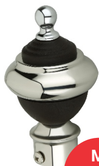
MI - 68