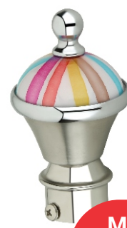
MI - 65