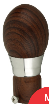
MI - 60