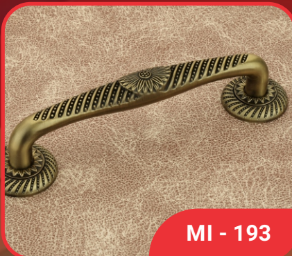
MI - 193