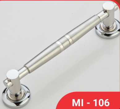
MI - 106