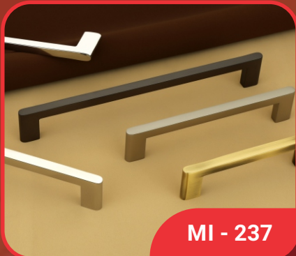
MI - 237