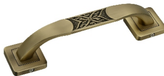
MI - 186