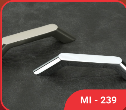
MI - 239