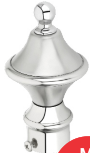
MI - 78