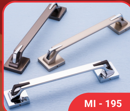
MI - 195