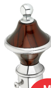
MI - 79