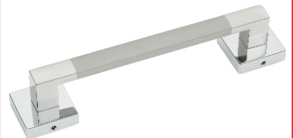
MI - 189