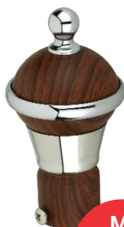
MI - 64