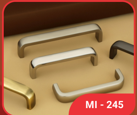
MI - 245